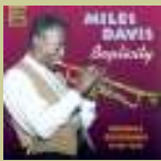
Miles Davis (1926 - 1991)