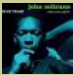
John Coltrane (1926 - 1967)